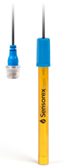
pH2100 Advanced (Flat Tip)