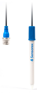
pH2200 Advanced (Spear Tip)